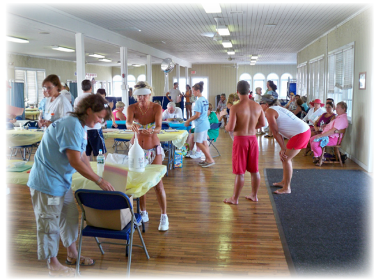
Beach-goers waiting to be screened in Belmar

The Monmouth County Regional Health Commission, Long Branch Health Department and Visiting Nurse Association