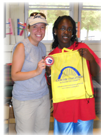
Camp Counselor and YEY program participant hold up a Cancer Coalition giveaway with educational info inside